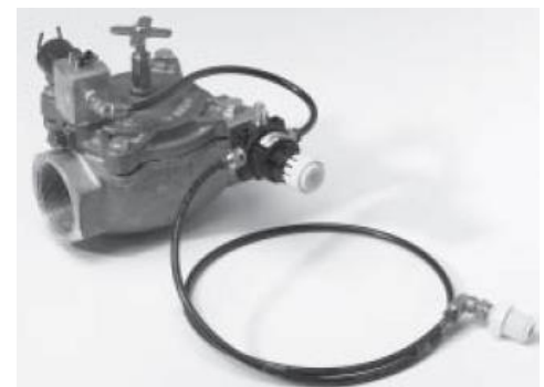
8200CR with XPR option